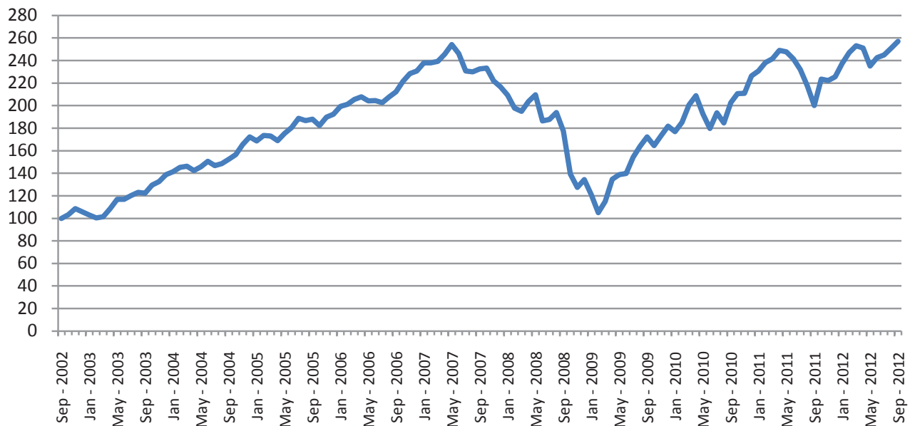
CRSP US MID CAP VALUE INDEX