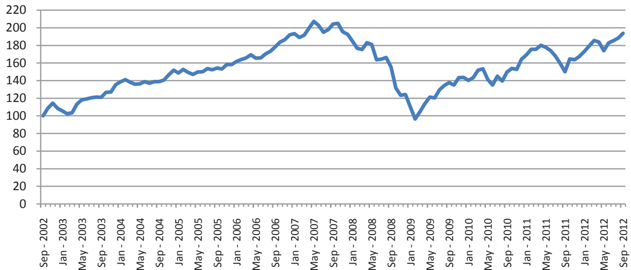
CRSP US MEGA CAP VALUE INDEX

Based on backtest data through September 7, 2012