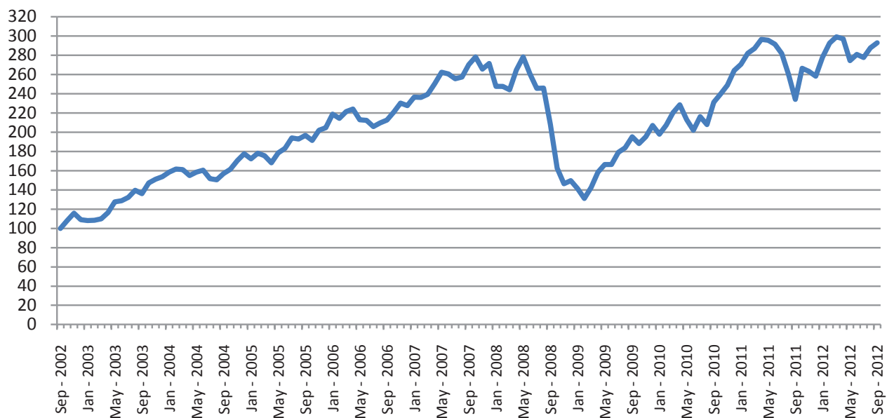
CRSP US MID CAP GROWTH INDEX

Based on backtest data through September 7, 2012